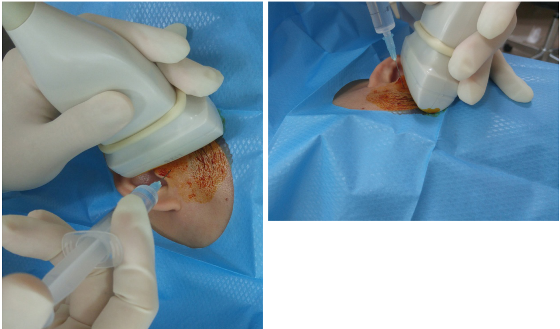
Figure 2. Position of ultrasound transducer and ATN block in out-of-plane. ATN: auriculotemporal nerve