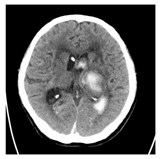
Figure 1. Brain computed tomography showed a large intracranial hemorrhage in the left basal ganglia and thalamus, with intraventricular hemorrhage.

syndrome and functional level showed no signs of improvement despite intensive rehabilitation until the next neurological event about two years following the initial illness.