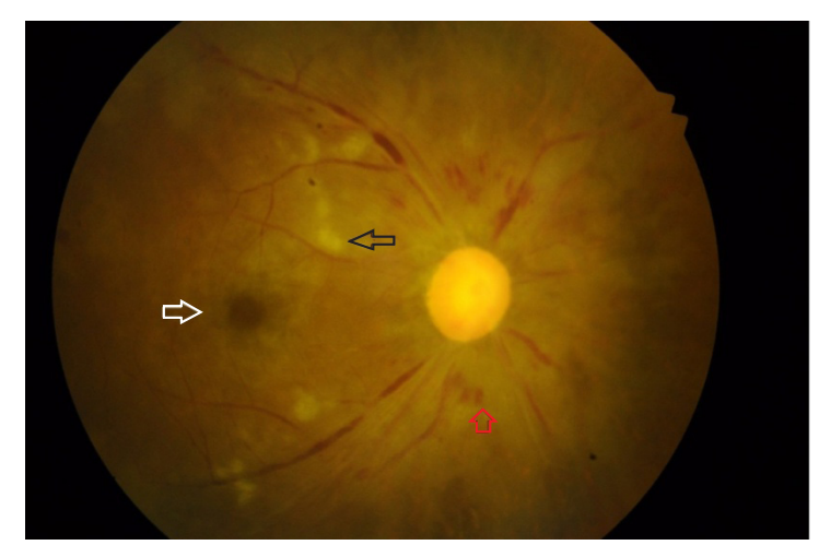
Figure 1. Fundus photograph showing multiple cotton wool spots (black arrow) and haemorrhage (red arrow) suggestive of ischaemic CRVO with cherry Red spot (white arrow), arterial attenuation, suggestive of associated CRAO

internal carotid artery on the right side with 90% occlusion on the left side. CT angiography was done which showed occlusion of bilateral internal carotid artery, noted from its origin to termination (Figure 3) with bilateral middle cerebral artery and anterior cerebral artery is reformatted from circle of Willis (Figure 4).