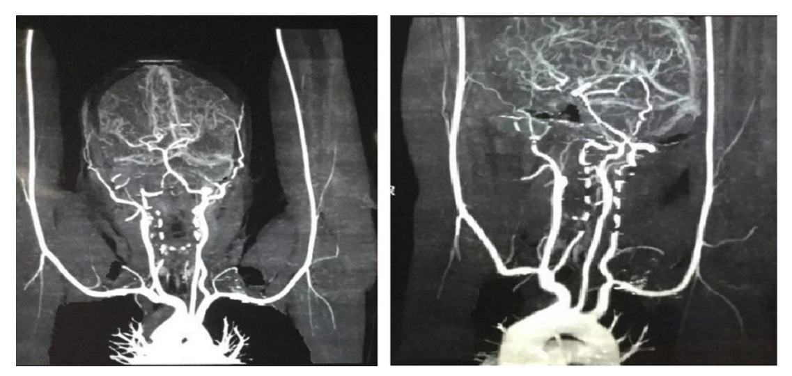
Figure 4. CT cerebral angiogram reformatted showing flow of middle cerebral artery and anterior cerebral artery from circle of Willis.

two types of protein C deficiency– type 1 being the most common, in which the concentration and functional activity of protein C are reduced. In type 2, the concentration is normal with only the functional activity being reduced. Protein C deficiency can also be acquired by many conditions like acute thrombosis, drugs like warfarin and oral contraceptive pills and liver